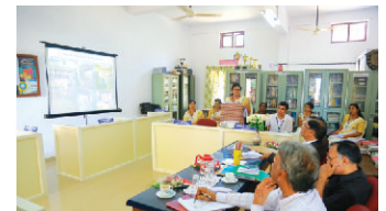
▲ Dept. Visit - Commerce