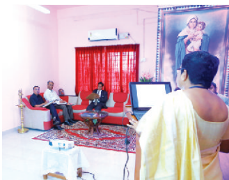
▲ Presentation by the Principal