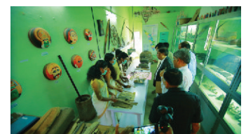
▲ Visit to Archeological Museum