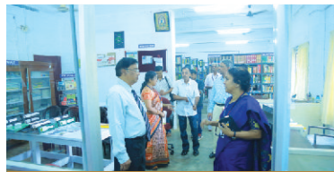
▲ Library Visit