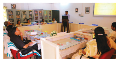
▲ Dept. Visit - English