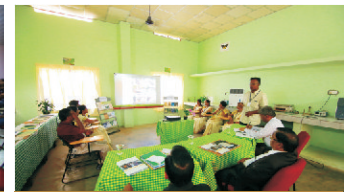
▲ Dept. Visit - Zoology