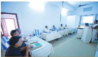
▲ Dept. Visit - Physics