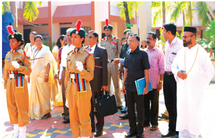
▲ Welcome by NCC Gadets