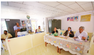
▲ Dept. Visit - History