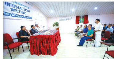
▲ Interaction with Alumni