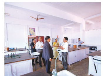
▲ Dept. Visit - Chemistry Lab