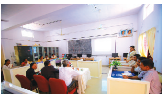
▲ Dept. Visit - Chemistry